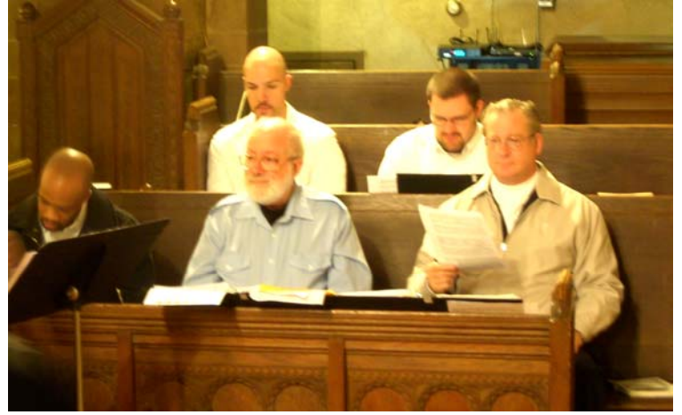
Chancel Choir Rehearsal